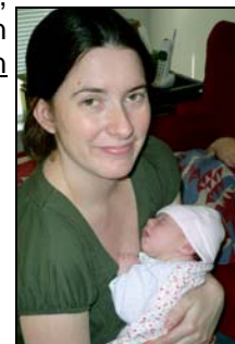
Our new granddaughter, born just ten minutes after we arrived by car at the Georgia hospital. Quite a feat of perfect timing after having sailed for days from Charleston, SC without the help of an engine! Mother and child doing fine, and so are we - finally back and starting repairs.