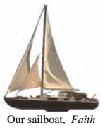
Our sailboat, Faith

Seventeen years serving the Caribbean & Central America