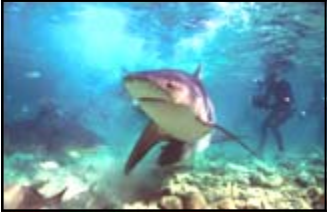
It was a shark like this one.