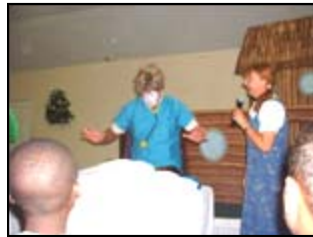
These photos taken during one of our Children's Crusades. Many more at our website: www.SailingServant.org