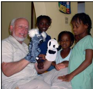
Bringing a little joy to these precious orphans