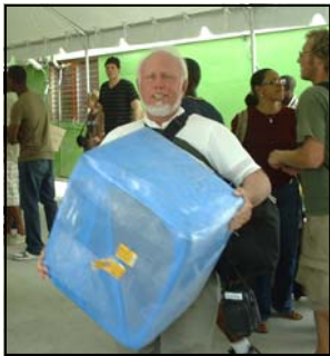
I arrived in Haiti with a case full of over 500 tent zippers

I just returned from Haiti and must admit that the situation there is almost overwhelming. The poorest country in our hemisphere is now facing the worst natural disaster in recent history. But praise God for the phenomenal response by the 'Body of Christ', both in giving aid and in bringing the Gospel to a people long oppressed by superstitions and the occult. Revival has broken out countrywide. I was awakened every morning before dawn by the sound of worshippers singing and praying in the streets, a sweet melody coming from every direction across the city.