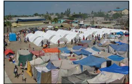
One of hundreds of tent cities