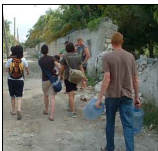
A group of young Canadian and American volunteers, some of the many we met and spent time with. Pray for all these faithful.