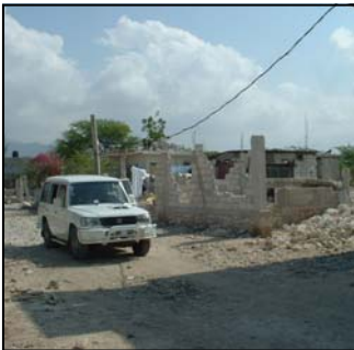
A pastor and his family survived the earthquake only to have a wall fall down during one of the many aftershocks, killing his wife!

Some may question why we even try when the needs are so great - what good can our small efforts do? It reminds me of the small boy who, early one morning, ran up and down the shoreline picking up starfish that had been beached during an over-night storm. A man nearby commented, "There are too many, son! What can it matter what you're doing there?" The boy picked up another and, before tossing it back into the sea, exclaimed, "It matters to this one !"