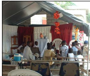
This large family lives in this temporary church after losing their own home.

Some may question why we even try when the needs are so great - what good can our small efforts do? It reminds me of the small boy who, early one morning, ran up and down the shoreline picking up starfish that had been beached during an over-night storm. A man nearby commented, "There are too many, son! What can it matter what you're doing there?" The boy picked up another and, before tossing it back into the sea, exclaimed, "It matters to this one !"