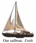
Our sailboat, Faith