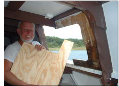
A bothersome window leak turned out to require replacing a whole section of wall

Maybe the one passage that has been on my mind the most this summer is the one in which Paul distinguishes some of us as "vessels of honor" while he calls others "vessels of dishonor" [study Rom 9:20-23] There has been considerable debate over all the implications of this passage, but let me just simply ask: Which would you rather be? How would you like to be remembered: as the 'Good Ship so-n-so' or the 'old derelict such-n-such'? [obviously I'm looking at this through a sailor's eyes]