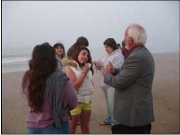
Sharing 'missionary stories' with curious youth on the beach

I had the opportunity to be with two local pastors and their members during an Easter sunrise service on the seashore. Though praying with the sea as a backdrop while a new day breaks is routine for us as sailing missionaries, I enjoyed watching the wonder and awe of those present, how the time and setting added so much to their prayer experience. Jesus said that they which "hunger and thirst after righteousness...shall be filled" (Mat 5:6) But I would add to that 'don't wait too late to eat!' Getting the strength and direction you need from the Lord at the start of your day will go far in helping you to make the most of that day, avoiding the pitfalls Satan may place in your path!