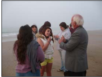
Sharing 'missionary stories' with curious youth on the beach

I had the opportunity to be with two local pastors and their members during an Easter sunrise service on the seashore. Though praying with the sea as a backdrop while a new day breaks is routine for us as sailing missionaries, I enjoyed watching the wonder and awe of those present, how the time and setting added so much to their prayer experience. Jesus said that they which "hunger and thirst after righteousness...shall be filled" (Mat 5:6) But I would add to that 'don't wait too late to eat!' Getting the strength and direction you need from the Lord at the start of your day will go far in helping you to make the most of that day, avoiding the pitfalls Satan may place in your path!