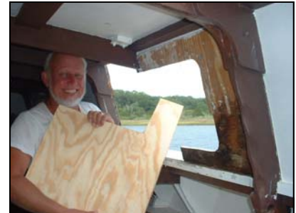
A bothersome window leak turned out to require replacing a whole section of wall

Maybe the one passage that has been on my mind the most this summer is the one in which Paul distinguishes some of us as "vessels of honor" while he calls others "vessels of dishonor" [study Rom 9:20-23] There has been considerable debate over all the implications of this passage, but let me just simply ask: Which would you rather be? How would you like to be remembered: as the 'Good Ship so-n-so' or the 'old derelict such-n-such'? [obviously I'm looking at this through a sailor's eyes]