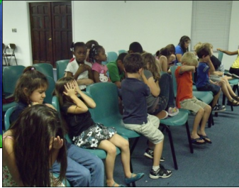
Little ones in serious prayer!!

enjoyed a winter harvest : souls saved, lives touched, churches helped, and many other blessings. We began with one of our children's crusades just before leaving Florida. Then participated in a 'Sunday School in the Park' event in Bimini as soon as