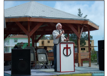
Special 'Sunday School in the Park' on island of Bimini with...