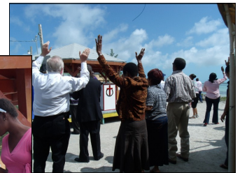
...wonderful spiritual results!

The conditions over the waters did open special doors for ministry into the boating community and the beginning of new friendships. I never tire of reaching out to these fellow sailors (some from all corners of the world) who