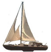
Our sailboat, Faith