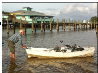
Now, once again, our dinghy (versatile two-part design) was stolen off a Nassau beach, leaving us struggling to get to shore at times. Pray for our wisdom in finding her replacement.

are our 'steps ordered by the Lord' but so are our stops!