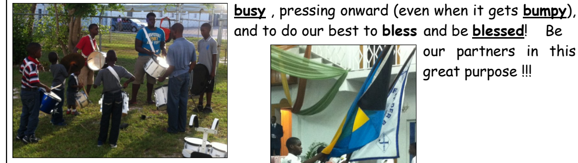
Some of our LBB young men we are so proud to instruct, inspire and invest our selves into.