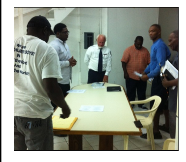
Men being trained in Bimini. Pray for this exciting program to reach all our boys on all our islands!