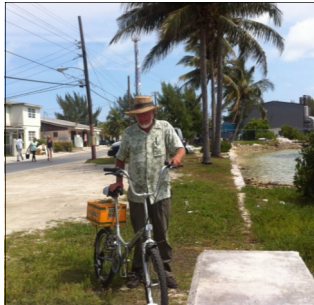
Our "car" in the islands

BUSY, BUMPY and BLESSED!! There is no better way to describe our ministry in the Bahamas. But - as always - we look forward to what God has next in store as opportunities for ministry keep lining up before us. As you can see in