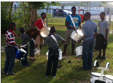
Some of our LBB young men we are so proud to instruct , inspire and invest our selves into.

these photos we certainly have been getting things done, with lives touched, souls saved, and church members inspired!! Last Fall hurricane Mathew came directly over us [see article on back] with winds over 130 miles per hour and it seemed our work might come to a halt. But we continue repairing our boat FAITH , visiting the islands by plane, and carry on the important work of writing literature for the scouting program we created for the Caribbean, LIFEBUILDER BOYS . Please continue lifting us and this great work in prayer - helping us to stay