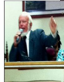
Preaching the Good News is always a priority

Thank you for being our partners in this great purpose !!!