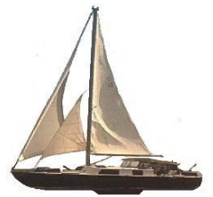
Our sailboat, Faith

BUSY, BUMPY and BLESSED!! There is no better way to describe our ministry in the Bahamas. But - as always - we look forward to what God has next in store as opportunities for ministry keep lining up before us. As you can see in