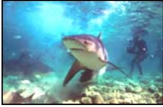
It was a shark like this one.