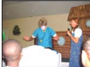
These photos taken during one of our Children's Crusades. Many more at our website: www.SailingServant.org